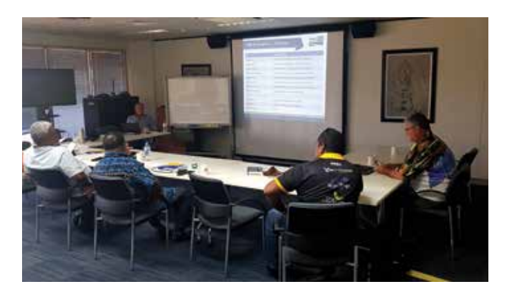
Fisheries Regional Ownership Framework Steering Committee meeting with Keogh Bay Consultants

The Fisheries Regional Ownership Framework is a project to deliver the aspiration of the Torres Strait to own and manage commercial fisheries access rights to Torres Strait fisheries.