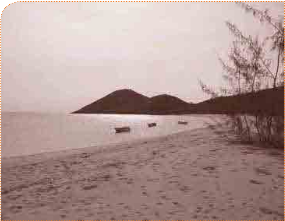
Prince of Wales Island.

Risk management at TSRA is based on the better practice principles and processes, outlined in the International Standard AS/NZ31000:2009 Risk Management - principles and guidelines on implementation .