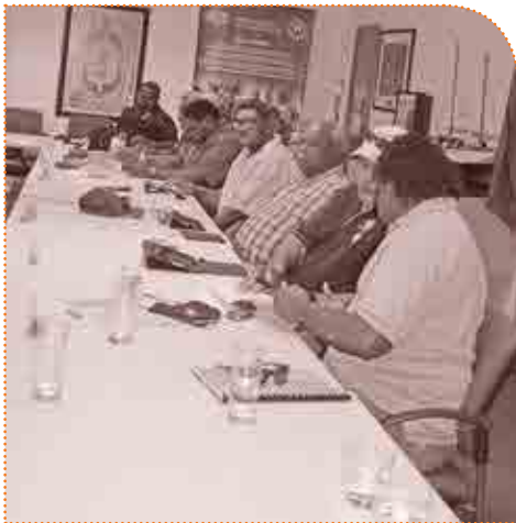
Members using iPads at Board Meetings.

TSRA Portfolio Members continued to receive group coaching and one-on-one mentoring this year. Executive coaching was provided though an external coaching service, Frank van Schagen and Associates. The coaching program ended in September 2010 and will resume after the TSRA Board election in March 2012.