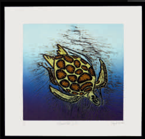
Floyd Sailor ( Ghostnet Turtle ) 2016