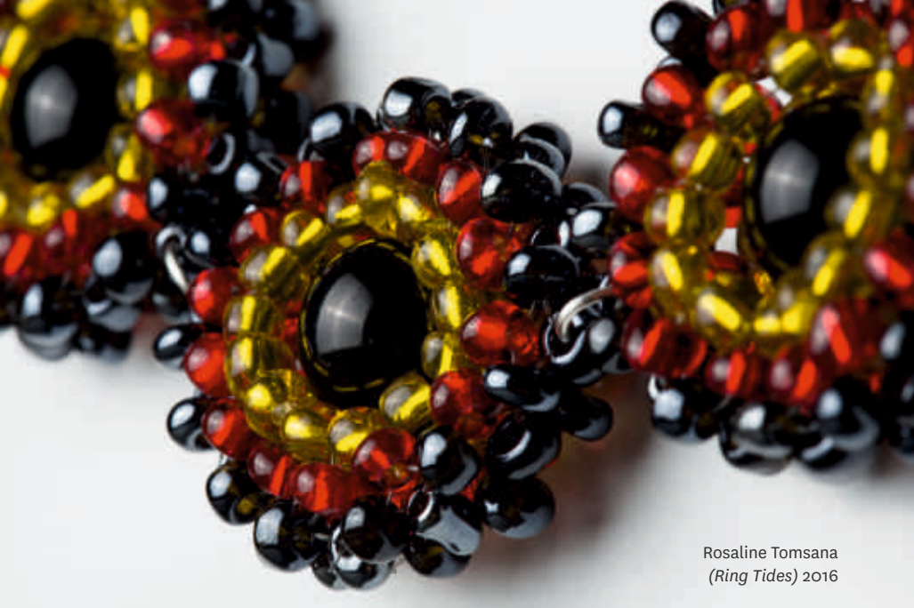
Rosaline Tomsana (Ring Tides) 2016