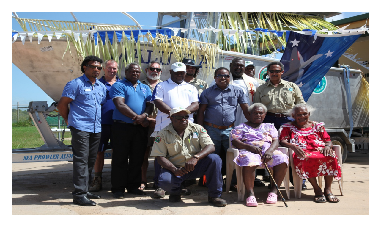
Caption: Members of the official party at the boat blessing.