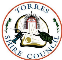
Torres Shire Council