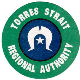
Torres Strait Regional Authority