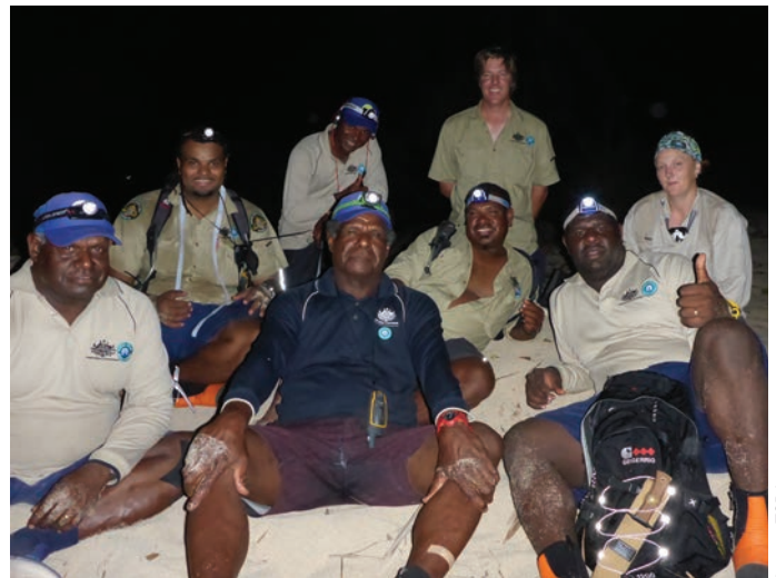
Dauar Island Turtle Tagging team