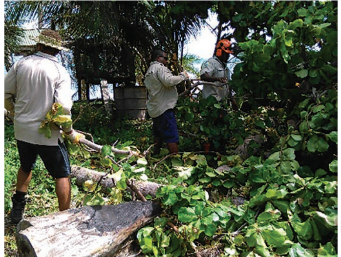
Rangers working on Country