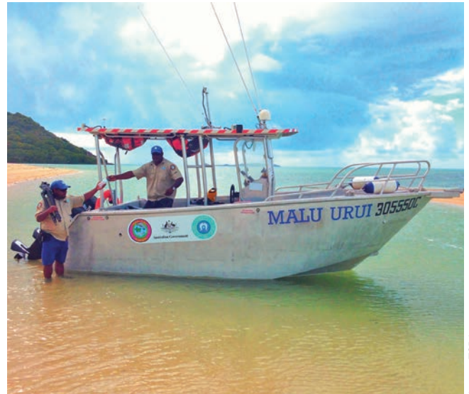
Iamalgal Rangers conducting Sea Patrol at Gebar Island

“Rangers continually engage with local community and share information about local plants and animals. For example, one Ranger found a trapped juvenile turtle in the community and talked to the childrens about looking after turtles. Rangers are also developing a animal and plants calendar that outlines what plants and animal are doing at each time of the year ”