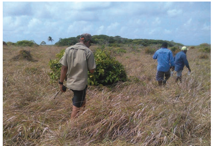
Land and Beach patrol-turtle nesting count on uninhabited islands around Poruma