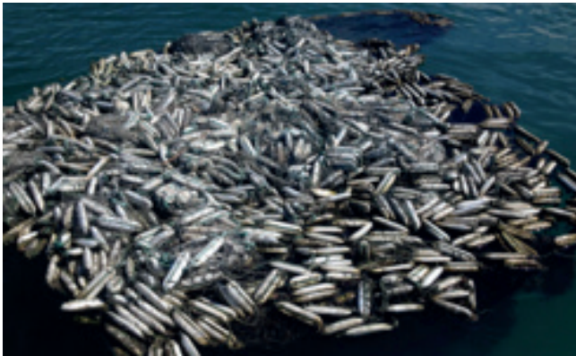
Ghost net found during sea patrol