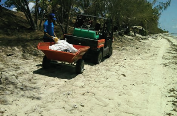
“Tangaroa Blue” activities on Poruma Island