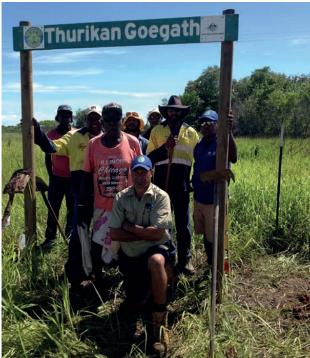
Rangers and community members complete sign erection