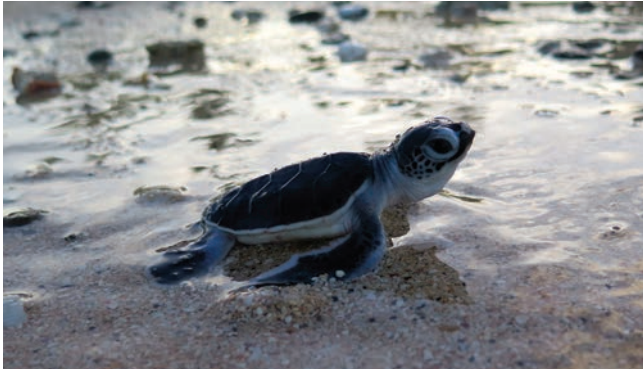
Turtle hatchling at Dauar Island