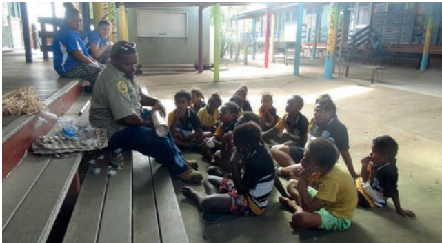
School visit to Erub Campus