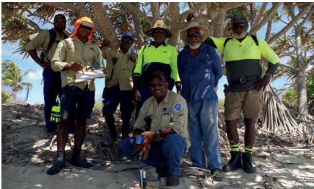
Rangers and Traditional Owners conduct survey on uninhabited islands