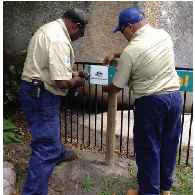
Rangers fence erected around sacred site