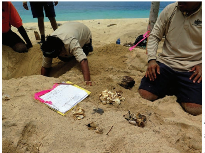
Rangers participate in Turtle hatchling survey