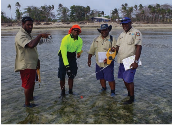
Seagrass monitoring at Poruma Island

“ Turtle surveys have been undertaken to identify nesting populations and nesting success rates. Rangers regularly engage with community about turtle and dugong management. Rangers regularly present at the school on turtle and dugong management and other topics) ”