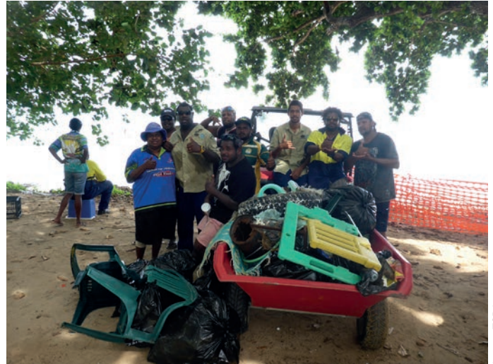
Community Beach clean-up Mer Island

“ Marine debris patrols have been carried out and debris has been removed from Mer and Dauar ”