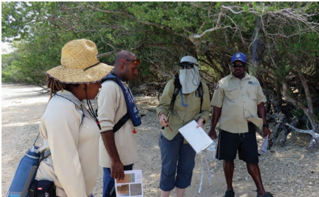
Rangers take part in Hawksbill survey around the Central Islands