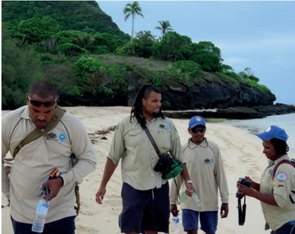
Rangers conduct survey on Dauar Island

“ Marine debris patrols have been carried out and debris has been removed from Mer and Dauar ”