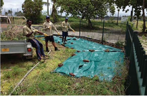
Rangers working on weed control