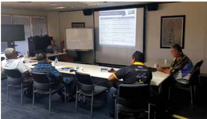
Fisheries Regional Ownership Framework Steering Committee meeting with Keogh Bay Consultants

The Fisheries Regional Ownership Framework is a project to deliver the aspiration of the Torres Strait to own and manage commercial fisheries access rights to Torres Strait fisheries.