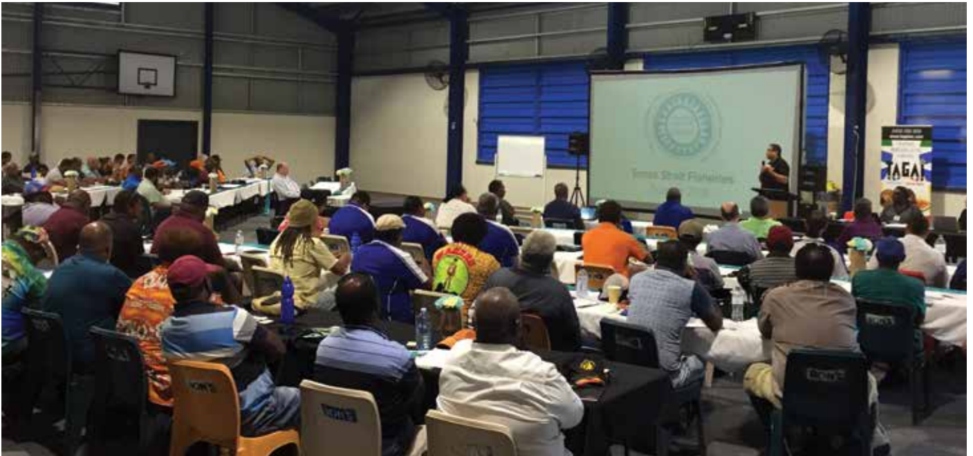
Opening of the 2018 Torres Strait Fisheries Summit

The TSRA Fisheries Programme hosted the three-day Torres Strait Fisheries Summit from 28-30 August 2018 on Thursday Island. The summit brought together approximately 100 key stakeholders with a focus and interest in the Torres Strait fishing industry.