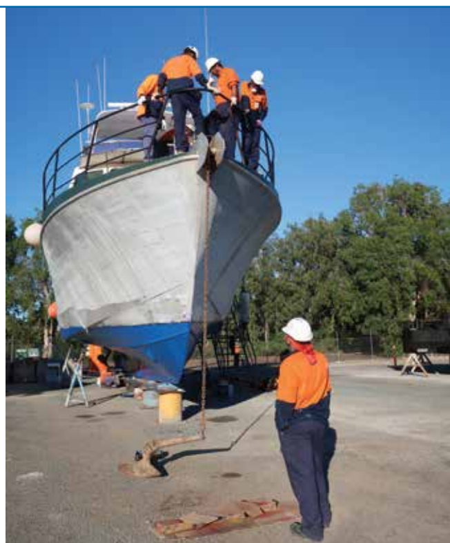
Participants of Growing Our Own – Tagai Transitions Maritime Project 2019

More information about these projects can be found at: www.tsra.gov.au/the-tsra/programmes/economic-development