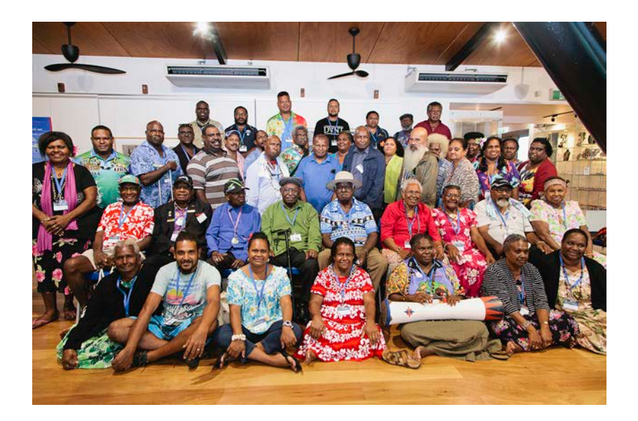
Delegates from across the Torres Strait at the inaugural Torres Strait Language Symposium